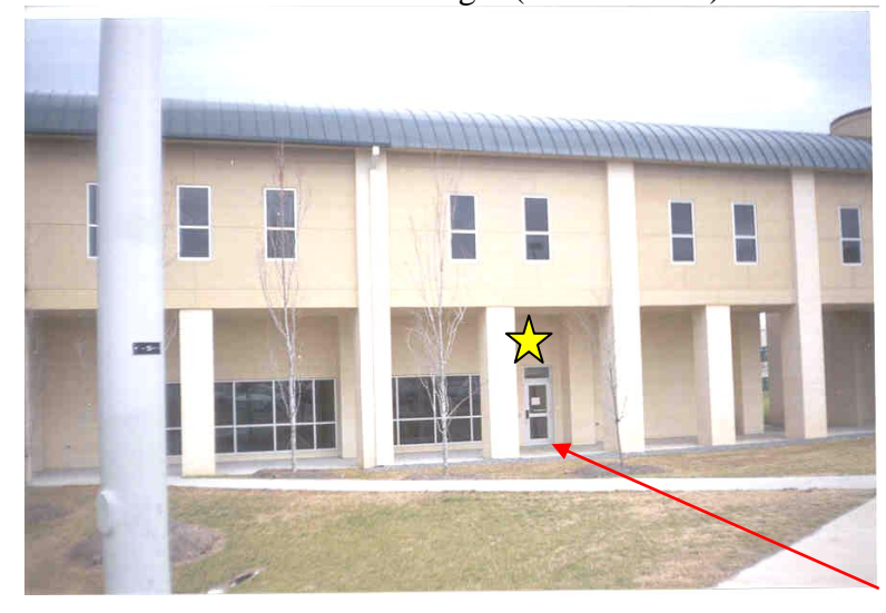
Edward Warren Life Science Building

the building. It is a single glass door that reads "Prospective & Employee Health." ( ) Enter through the single door and go down the hall to the 4<sup>th</sup> door on the right (double doors)