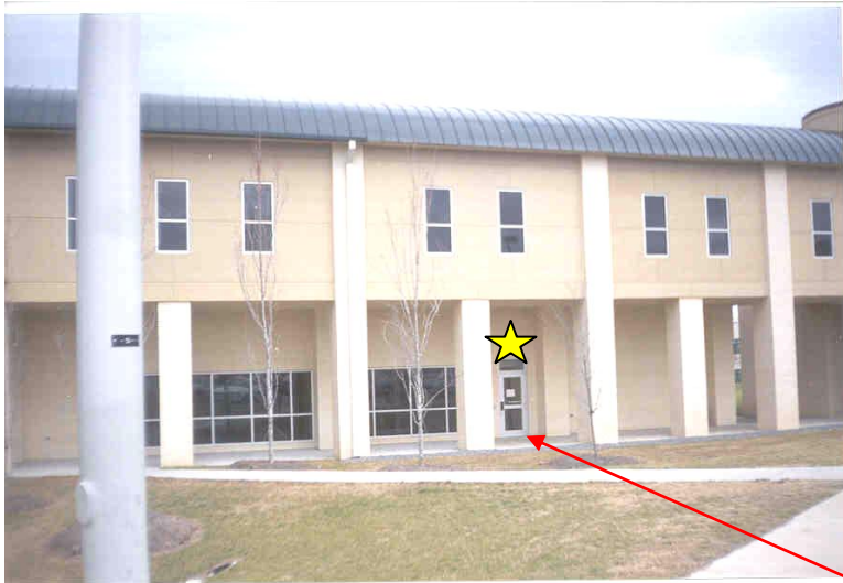
Edward Warren Life Science Building

building. It is a single glass door that reads “Prospective & Employee Health.” (★) Enter through the single door and go down the hall to the 4 th door on the right (double doors)